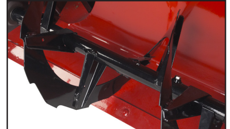
Adjustable Scraper Bar