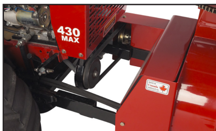
Quick Hitch and Drive System