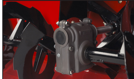
Serrated Auger and Heavy Duty Gear Box