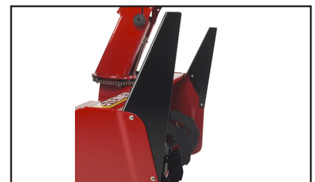
Optional Drift Cutter Bars