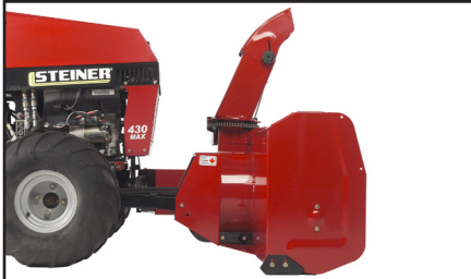
10 Gauge Steel Side Panels