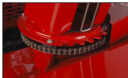
Hydraulic Chute Rotation with Chain Drive