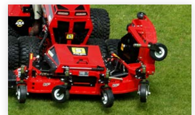
Flip up wing for easier storage and transporting

All Steiner products are made with pride in the U.S.A. and are warranted commercially for 2 years.