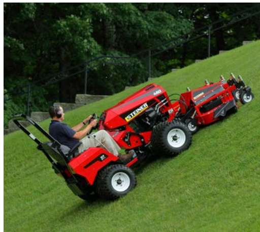
Great on Slopes