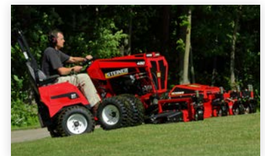
Allows for tighter radius turning