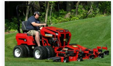
Provides Stronger Cutting Torque