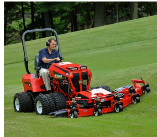
Contours to Undulating Turf